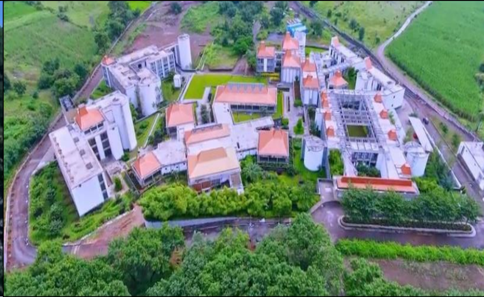
Pune (Maharashtra) Campus