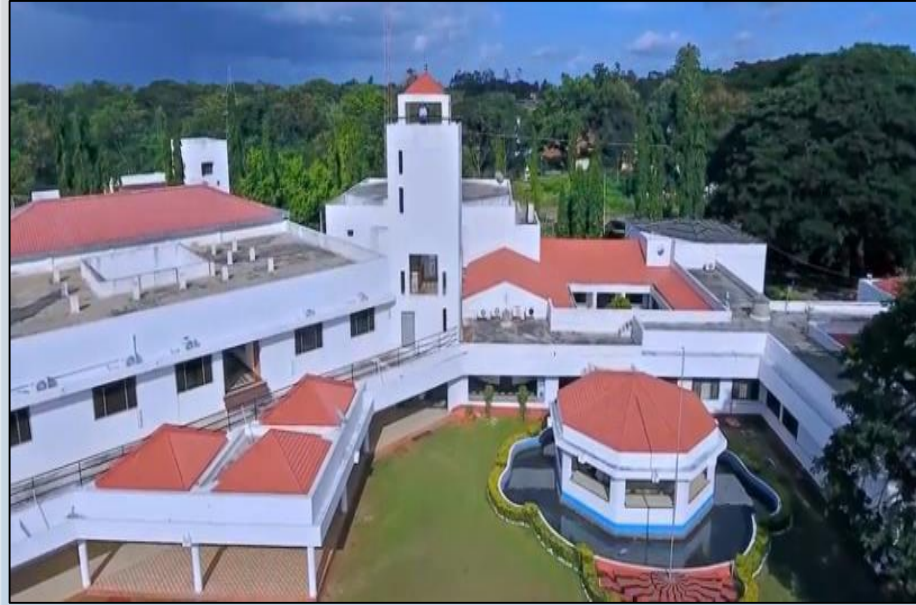
Harihar (Karnataka) Campus