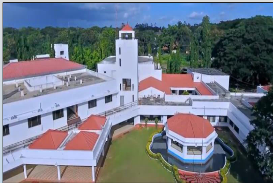
Harihar (Karnataka) Campus