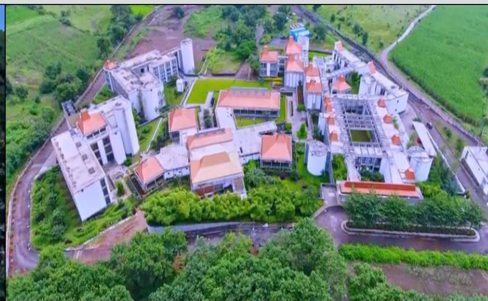
Pune (Maharashtra) Campus